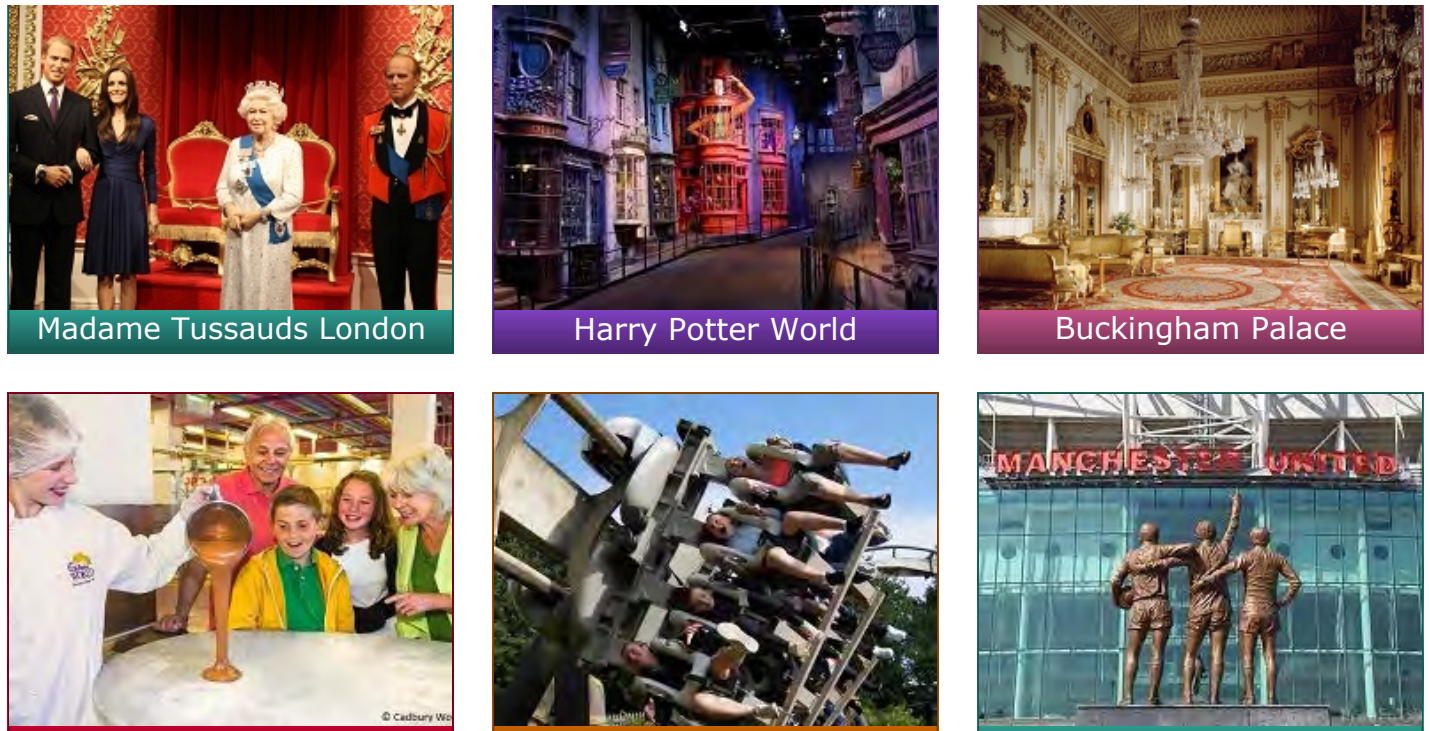
Cadbury World & Stratford