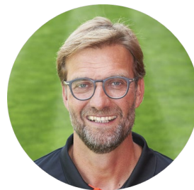
Jürgen Klopp Manager

Wherever you are lucky enough to attend a LFC coaching programme we hope you have fun and enjoy learning how to play ‘The Liverpool Way’.”